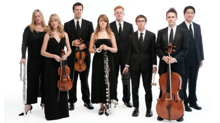
TOP: ARS LONGA AT CORPUS CHRISTI CHURCH, FEBRUARY 2017. PHOTO: ROEY YOHAI; BOTTOM: TALEA ENSEMBLE. PHOTO COURTESY OF THE ARTISTS

At the Center for Architecture, 536 LaGuardia Place, New York