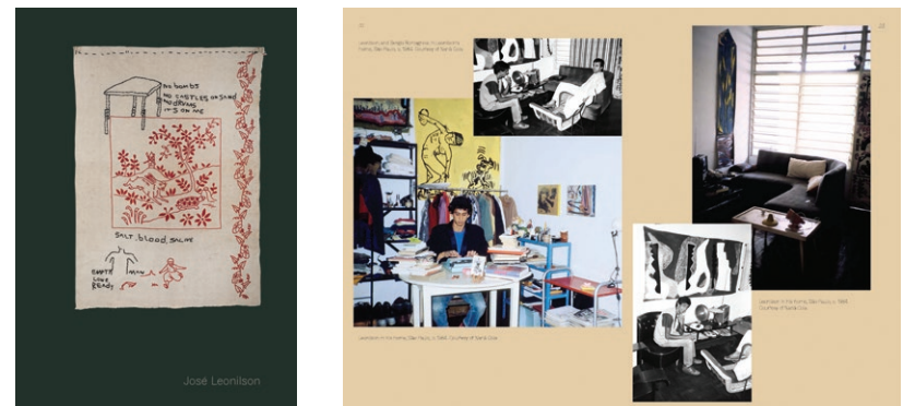
TOP: A PAIXÃO DE JL, 2015. DIR.: CARLOS NADER. COURTESY OF PROJETO LEONILSON AND ITAÚ CULTURAL; BOTTOM: COVER AND INTERIOR SPREAD OF JOSÉ LEONILSON: EMPTY MAN (NEW YORK: AMERICAS SOCIETY, 2018)