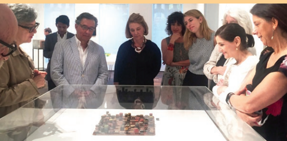
GROUP VISIT TO ANOTHER SPACE, NEW YORK

For more information, please contact Veronica Flom at vflom@as-coa.org