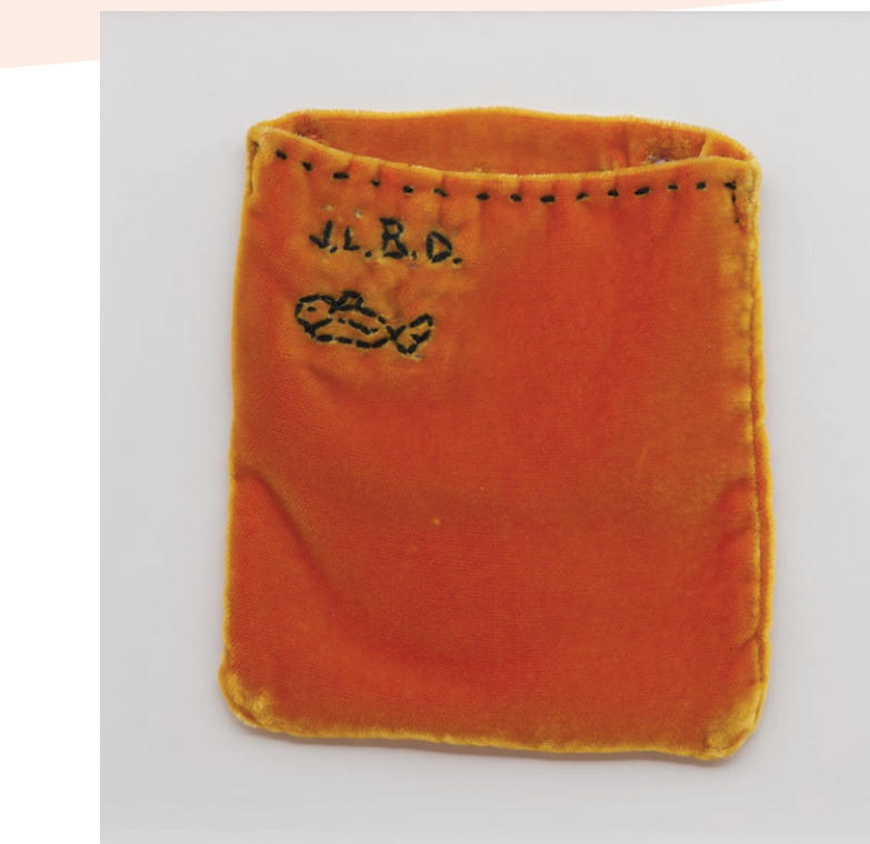
JOSÉ LEONILSON BEZERRA DIAS, BOLSINHO [SMALL POCKET], 1992. THREAD ON VELVET. COURTESY OF BEZERRA DIAS FAMILY COLLECTION / PROJETO LEONILSON

Gallery hours: Wednesday–Saturday, 12:00 to 6:00 P.M. Admission: Free