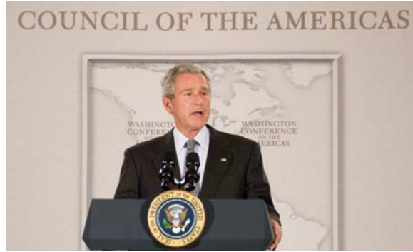
George W. Bush, President of the United States

U.S. President George W. Bush and Panamanian President Martín Torrijos joined hemispheric leaders at the Council of the Americas' premier annual forum, the 2008 Washington Conference on the Americas. Business and policy leaders from across the Americas gathered to hear views on competitiveness, international trade, hemispheric adjudication, and U.S. relations toward the region.