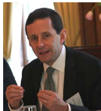
José de Gregorio, President, Central Bank of Chile