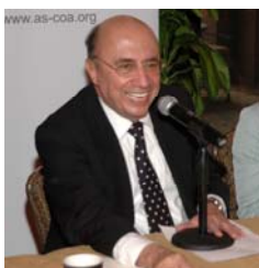
Henrique Meirelles, President, Central Bank of Brazil