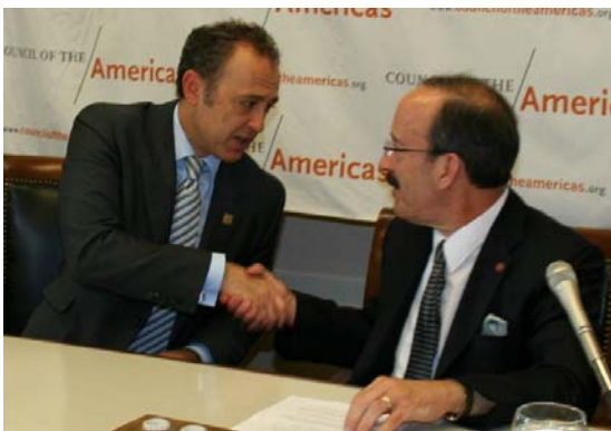
Amb. Arturo Sarukhan, Ambassador of Mexico, and Congressman Eliot L. Engel (D-NY), Chairman of the Subcommittee on the Western Hemisphere, discussed the Merida Initiative on Capitol Hill.