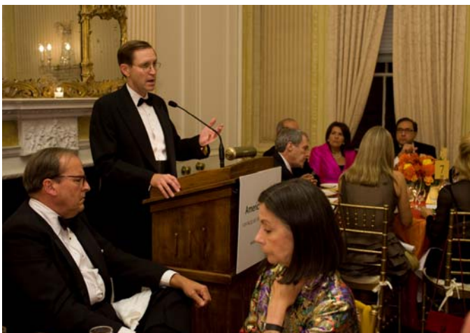
Dr. Glenn Hubbard, Colombia University School of Business

The 2008/2009 Inaugural Dinner celebrated the upcoming season of programs at Americas Society and Council of the Americas. Congressman Gregory W. Meeks and Dr. Glenn Hubbard discussed the challenges facing the global financial system and the importance of engaging more closely with Latin America on common issues.