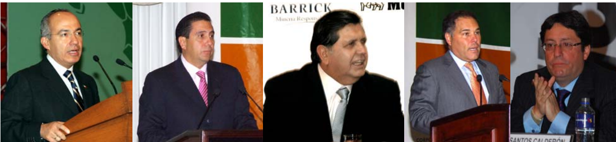
PL to R: resident of Mexico Felipe Calderón; President of Panama Martín Torrijos; President of Peru Alan García; Vice President and Minister of Foreign Relations of Panama Samuel Lewis Navarro; Vice President of Colombia Francisco Santos Calderón