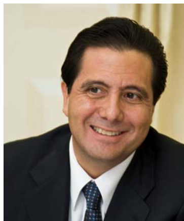
L to R: Antonio Saca, President of El Salvador. Fernando Lugo, President of Paraguay. Martín Torrijos, President of Panama.