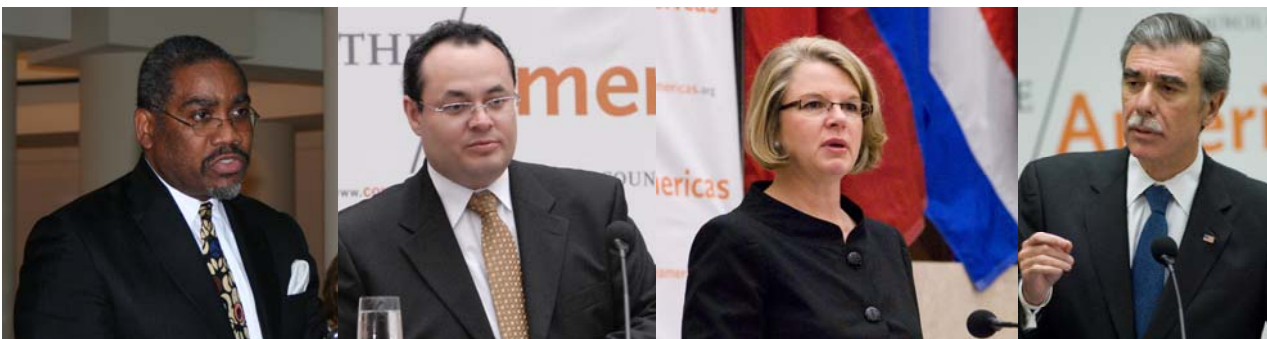
L to R: Gregory Meeks, U.S. House of Representative; Luis Carranza Ugarte, Minister of Economy and Finance, Peru; Margaret Spellings, U.S. Secretary of Education; Carlos Gutierrez, U.S. Secretary of Commerce