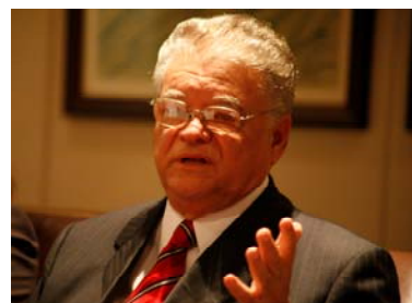
Karl Samuda, Minister of Industry, Investment, and Commerce, Jamaica