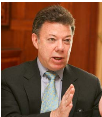
Juan Manuel Santos, Minister of Defense, Colombia