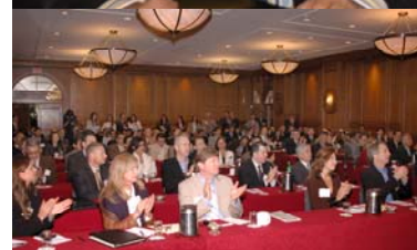
Top: Francisco Santos Calderón, Vice President of Colombia Bottom: Audience