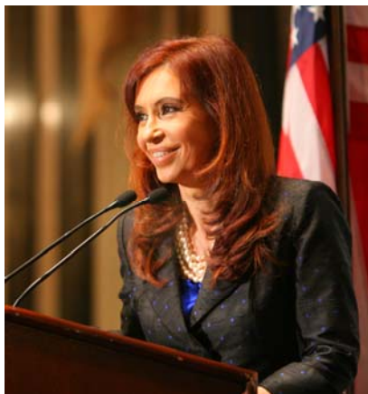
L to R: Felipe Calderón, President of Mexico. Cristina Fernández de Kirchner, President of Argentina.