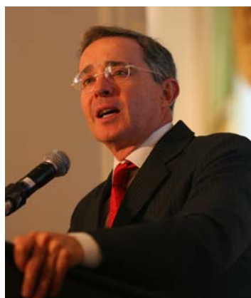
L to R: George W. Bush, President of the United States. Álvaro Uribe, President of Colombia.