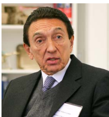
Edison Lobão, Minister of Mines and Energy, Brazil