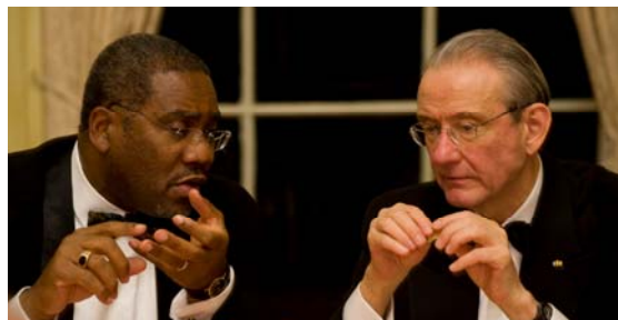
Congressman Gregory W. Meeks (D-NY), U.S. House of Representatives; William R. Rhodes