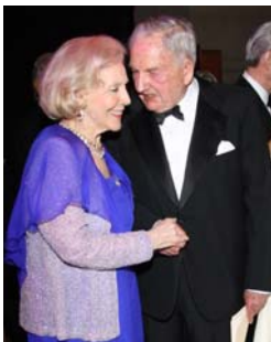
Amalia Lacroze de Fortabat; David Rockefeller