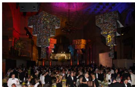
Cipriani Wall Street