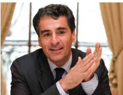
Andrés Velasco, Minister of Finance, Chile