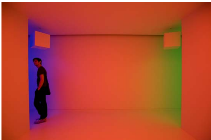
(In)formed by Color: Carlos Cruz-Diez

The 2008 cultural season featured stimulating discussions, exhibitions, presentations, and performances by cultural luminaries from across the Americas. Highlights included the exhibition (In)formed by Color: Carlos Cruz-Diez , the Venezuelan kinetic art master's first solo show in a major institution, an opera performance by rising stars of Argentina's renowned Instituto Superior de Arte del Teatro Colon , and a book presentation by Pulitzer Prize winner Junot Díaz .