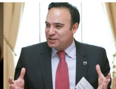
Luis Guillermo Plata, Minister of Commerce, Industry, and Tourism, Colombia