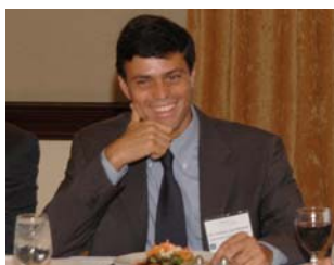
Leopoldo López, Mayor of Chacao in Caracas, Venezuela