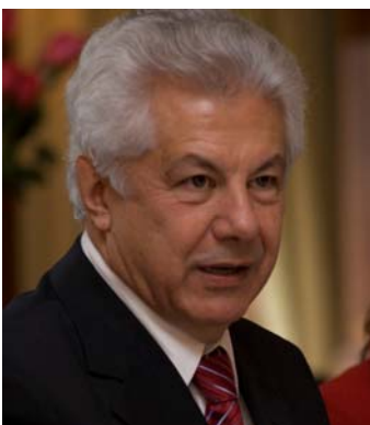
Arlindo Chinaglia, Speaker of Brazil's House of Representatives