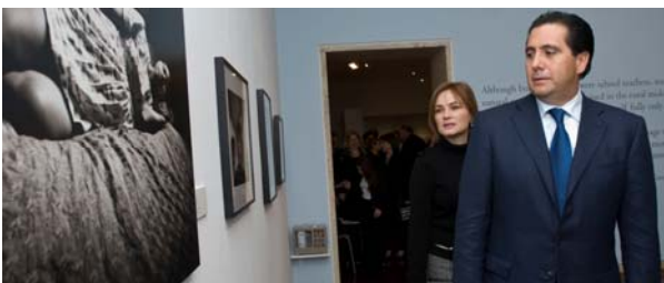
Martín Torrijos, President of Panama, and the first lady