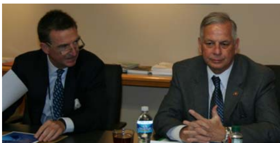
Brian O'Neill, U.S. Department of Treasury; Congressman Gene Green (D-TX) during a discussion of trade and energy issues.