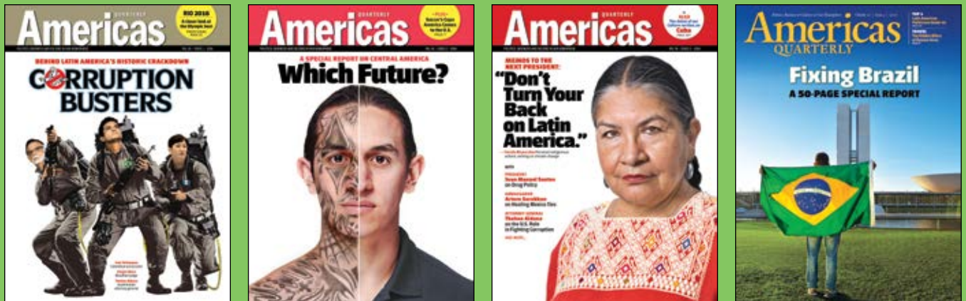
Above: Issue 1, Issue 2, Issue 3, Issue 4