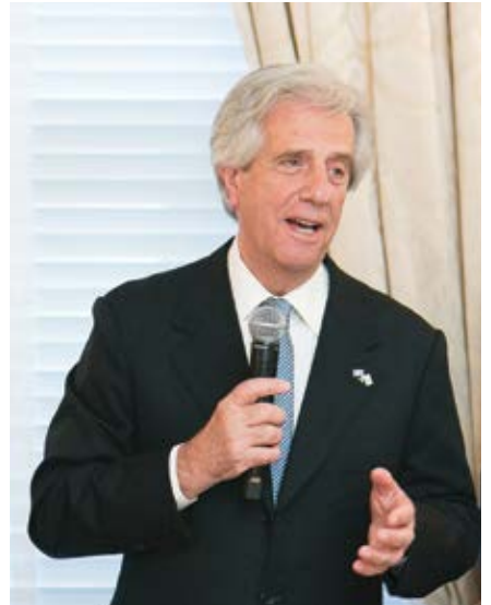
Row 1: Michel Temer, President of Brazil • Pedro Pablo Kuczynski, President of Peru • Juan Manuel Santos, President of Colombia