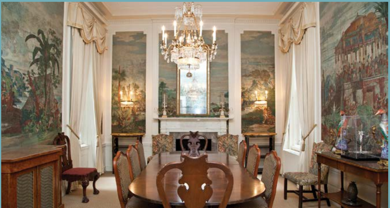
Row 1, L to R: An assistant restorer applies paint using a syringe on one of the wall panels • Before and after photos of a portion of the wallpaper • An assistant restorer cleans one of the wall panels Row 2: Room shot of the Incas Room at 680 Park Avenue, NY