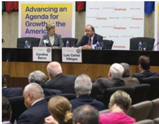
Row 4: Carolina Barco, former Minister of Foreign Affairs, Colombia; Luis Carlos Villegas, Minister of Defense, Colombia • Roberta Jacobson, U.S. Assistant Secretary of State for Western Hemisphere Affairs