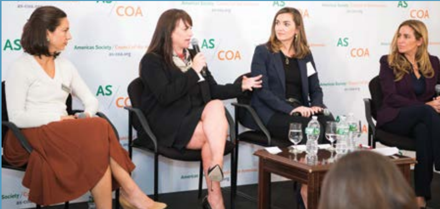
AS/COA Women's Hemispheric Network as-coa.org/women