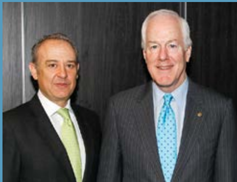
North American Trade Initiative as-coa.org/trade