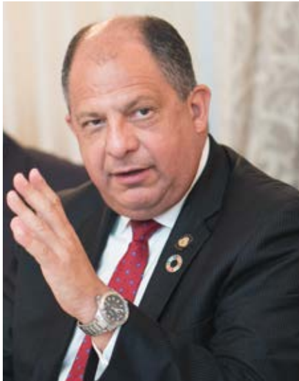
Row 3: Luis Guillermo Solís, President of Costa Rica • Jimmy Morales, President of Guatemala