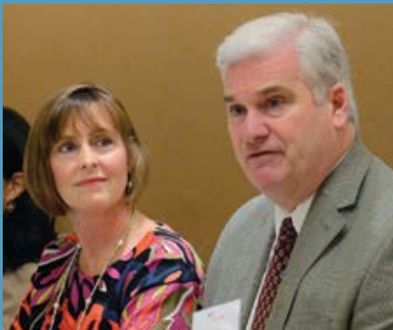
AS/COA Cuba Working Group as-coa.org/cuba