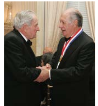
Row 3: David Rockefeller with U.S. President George H. W. Bush • David Rockefeller awards the Canadian Prime Minister Brian Mulroney the Gold Insigne in 1988 • Colombian artist Fernando Botero donating the painting El Presidente to Americas Society in 1988, with David Rockefeller