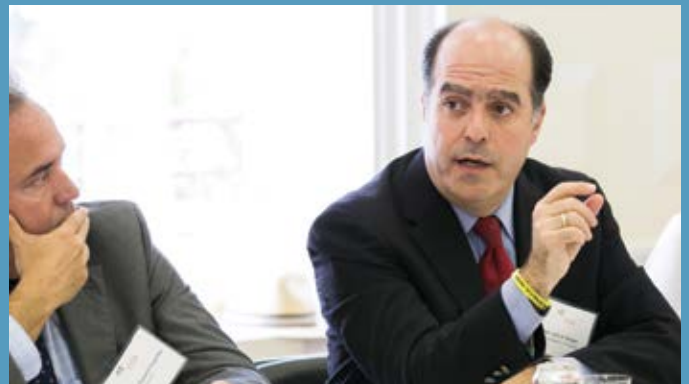
Venezuela Working Group More: as-coa.org/venezuela