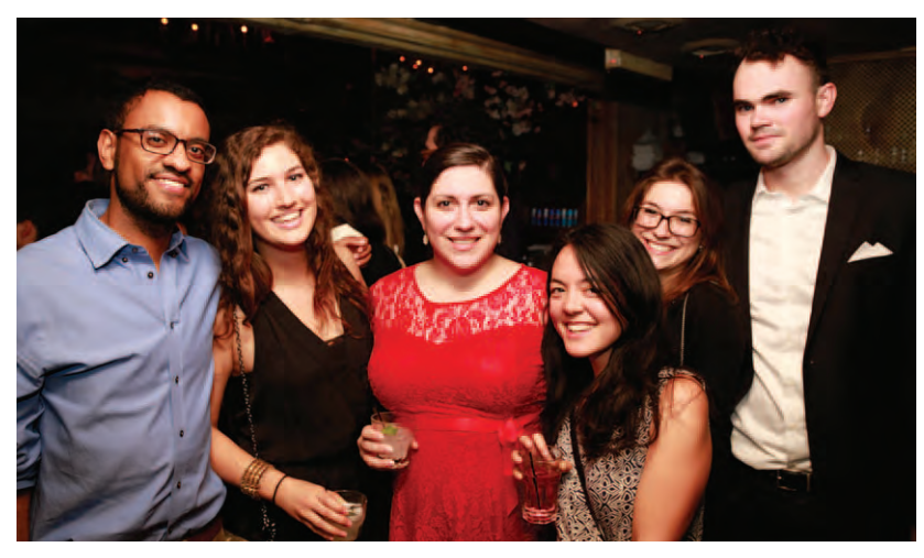
LEFT: CEILING IN SALON BOLIVAR (DETAIL); ABOVE: YPA HOLIDAY SPECTACULAR AT THE BOX, DECEMBER

government, design, consulting, law, and the arts. Membership includes exclusive access to our networking and social events, such as private art fair tours, concerts, and intimate cafecitos with such as private art fair tours, 12 industry leaders around professional development.