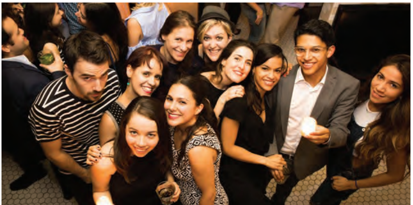
LEFT: INTERIOR VIEW OF 680 PARK AVENUE; ABOVE: YPA "HAVANA SOCIAL CLUB" PARTY AT CHLOE 81, JUNE 2016.

Young Professionals of the Americas (YPA) is an international network that provides a platform for young professionals in their 20s and 30s to connect around the latest trends in the Americas through its New York City and Miami chapters. Members come from various nationalities and represent a diverse spectrum of professional sectors, including venture capital and finance, fashion, government, design, consulting, law, and the arts. Membership offers exclusive access to our networking and social events, such as private art fair tours, concerts, and intimate talks with industry leaders around professional development.