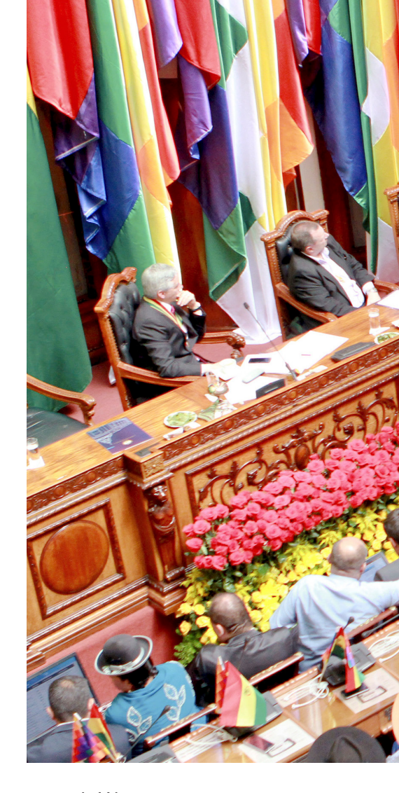
Women held just over half of the seats in Bolivia's Plurinational Legislative Assembly in 2016.

It is a similar story of highs and lows for LGBT lawmakers. In many ways, Latin America leads the world in advancing LGBT equality at a legislative level, and few cities can boast of being gay-friendly destinations like São Paulo, Rio de Janeiro and Buenos Aires. But violence against LGBT people remains rife in the region as a whole, and a lack of LGBT representation in politics has been one barrier to passing the kind of antidiscrimination laws that could target such violence. In February 2017,