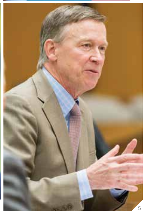
5/ John Hickenlooper , Governor of Colorado