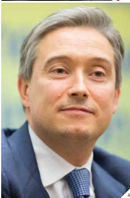
4/ François-Philippe Champagne , Minister of International Trade, Canada