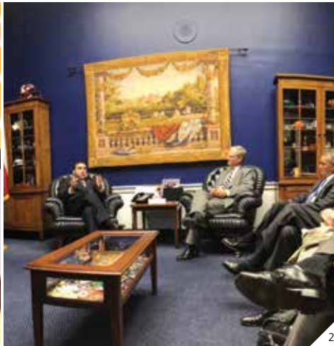
2/ Meeting with U.S. Representative Henry Cuellar (D-TX) and Trade Advisory Group senior representatives