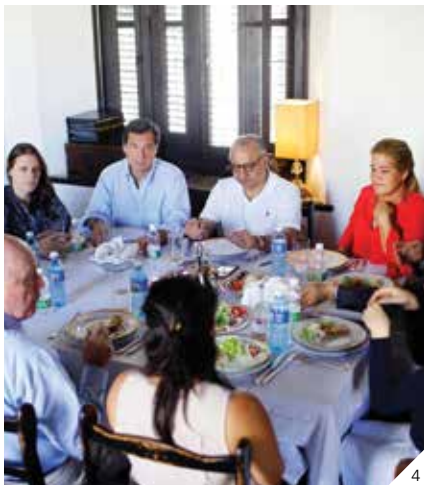
4/ Cuban entrepreneurs brief members during AS/COA's eighth delegation to the island