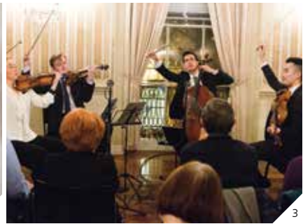
3/ First-place winners of the 2016 Banff International String Quartet Competition Rolston String Quartet perform at Americas Society.