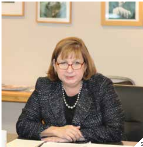
5/ Sue Saarnio , U.S. Acting Special Envoy and Coordinator for International Energy Affairs, U.S. State Department