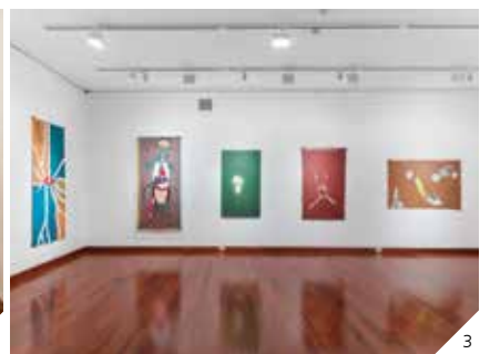
3/ José Leonilson: Empty Man . Installation view