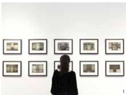
1/ Facundo de Zuviria: Siesta Argentina and other modest observations . Installation view