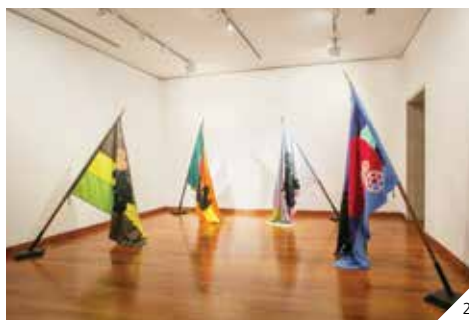
2/ Erick Meyenberg: The wheel bears no resemblance to a leg . Installation view