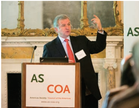
Public Discussion with Felipe Larrain, Minister of Finance, Chile