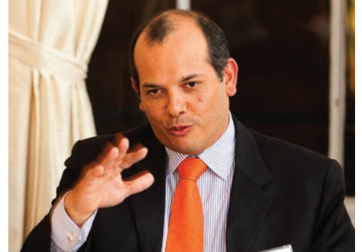
Private Dinner with Miguel Castilla, Minister of Economy and Finance, Peru