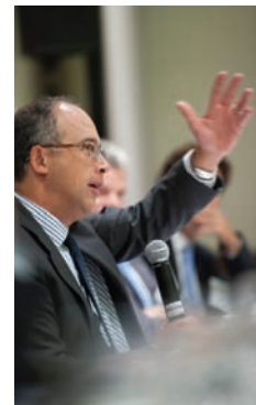
Private Dinner in Colombia. Juan Carlos Echeverry, Minister of Finance, Colombia