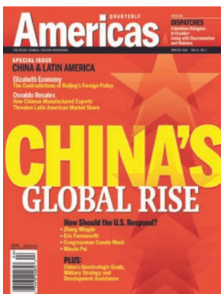
AQ Winter 2012