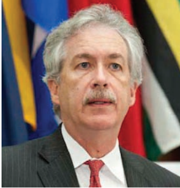
William Burns, U.S. Deputy Secretary of State