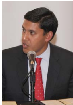
Private Lunch with Dr. Rajiv Shah, Administrator, U.S. Agency for International Development