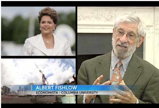
AQ's first TV news segment aired on NTN 24's Efecto Naim .