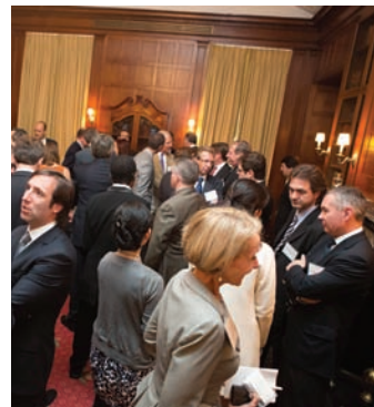
A networking reception was held prior to the private luncheon with President Cristina Fernández de Kirchner of Argentina.