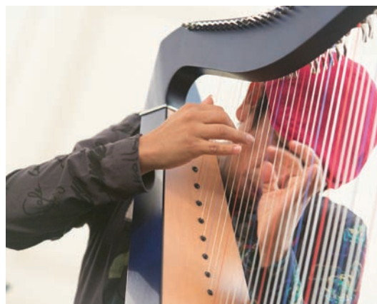
Virtuoso harpist Edmar Castañeda