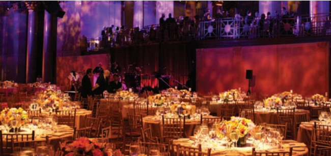
Cipriani Wall Street