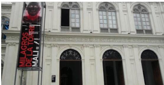
Indicios: Milagros de la Torre, a concurrent exhibition held at Museo de Arte de Lima