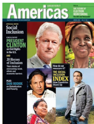
AQ Spring 2012