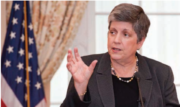
Janet Napolitano, U.S. Secretary of Homeland Security