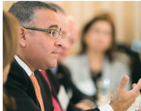
Mauricio Funes, President of El Salvador