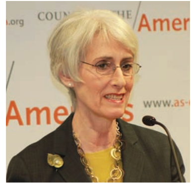
A Conversation with Wendy Sherman, U.S. Under Secretary for Political Affairs