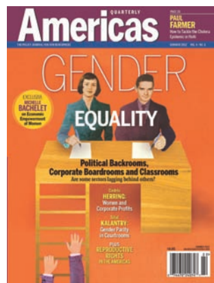
AQ Summer 2012