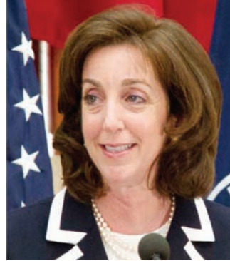
Roberta Jacobson, U.S. Assistant Secretary of State for Western Hemisphere Affairs