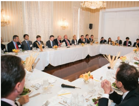
AS/COA hosted President of Colombia Juan Manuel Santos for a private dinner in May.