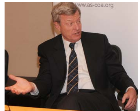
Private Meeting: Senator Max Baucus (D-MT), Chairman of the Senate Finance Committee