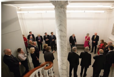
AS/COA hosted a dedication ceremony honoring David Rockefeller.