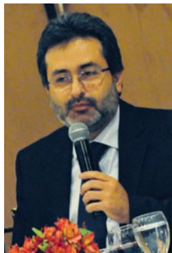
Private Dinner in Peru. Juan Federico Jiménez Mayor, Prime Minister of Peru