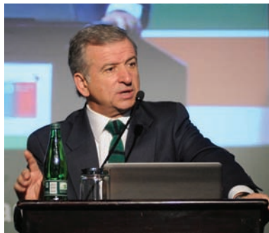
Felipe Larraín, Minister of Finance, Chile