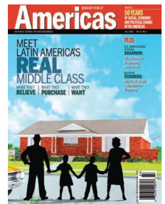
AQ Fall 2012