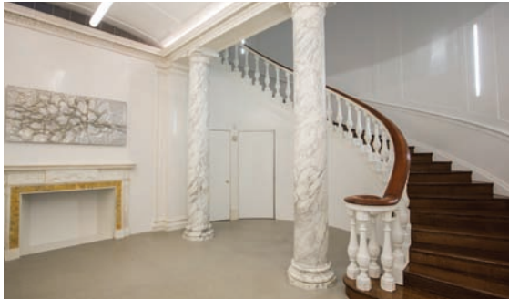
The David Rockefeller Atrium was completed in the fall of 2012.

As a tribute to our founder and honorary chairman, Americas Society renovated the entrance hall of our historic headquarters at 680 Park Avenue in his name and honor. Internationally renowned architect and Americas Society board member Enrique Norten and his firm Ten Arquitectos designed the new space to reflect the evolution of the institution and the new Latin America with America Society's mission and legacy. In December, Mr. Rockefeller and the donors to the project gathered for an unveiling ceremony to formally dedicate the new David Rockefeller Atrium.