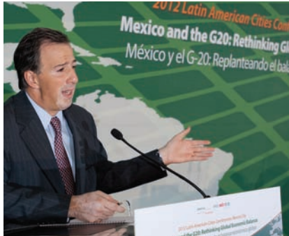
José Antonio Meade, Secretary of Finance and Public Credit, Mexico