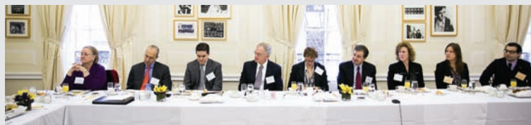
Participants listen to an off-the-record briefing on AS/COA's Cuba delegation trip.