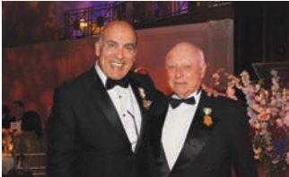
Muhtar Kent and Jorge Gerdau Johannpeter, honorees and recipients of the Americas Society Gold Medal