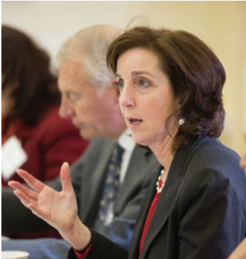
Private Luncheon with Roberta S. Jacobson, U.S. Assistant Secretary of State for Western Hemisphere Affairs

AS/COA held 152 members only elite programs in 2012, creating a space for networking and dialogue with presidents, ministers, senior officials, and business leaders. These small, off-the-record events address some of the most critical issues confronting the hemisphere today, including energy, the global economy, infrastructure, social inclusion, security, tourism, and trade.