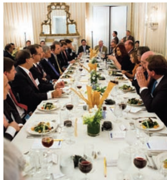
AS/COA hosted President of Argentina Cristina Fernández de Kirchner for a private luncheon.