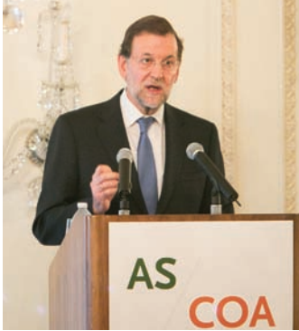
Mariano Rajoy, Prime Minister of Spain