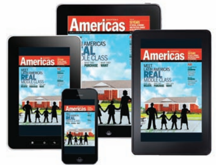
AQ launched its new app for Apple, Android, and Kindle Fire.