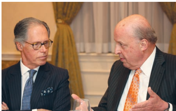
Welcome Reception for New Ambassador of Colombia to the U.S. Carlos Urrutia. Carlos Urrutia; Amb. John Negroponte, Chairman, AS/COA