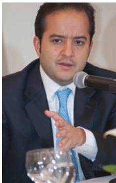
Private Dinner in Mexico. Alejandro Poiré, Secretary of the Interior, Mexico