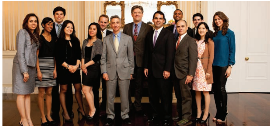
The AQ team at the 5th Anniversary on April 19, 2012