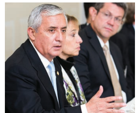
Otto Pérez Molina, President of Guatemala