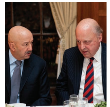
Private Dinner with Carlos Salinas, Former President of Mexico. Salinas; Amb. John Negroponete, Chairman, AS/COA