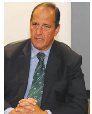
Private Meeting with Juan Camilo Restrepo, Minister of Agriculture and Rural Development of Colombia