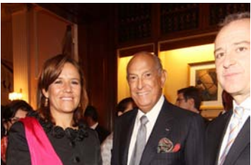
First Lady of Mexico Margarita Zavala de Calderón, Oscar de La Renta, and Ambassador Arturo Sarukhan