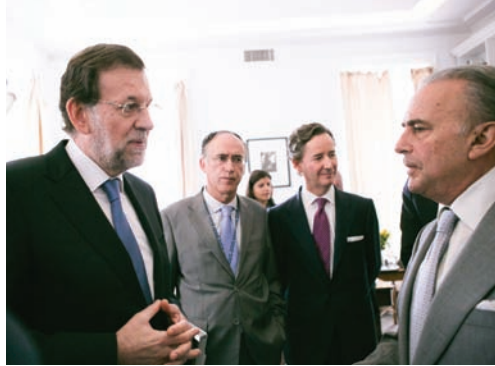
Prime Minister of Spain Mariano Rajoy speaking with Gustavo Cisneros of Cisneros Group of Companies.