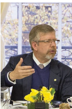
Private Lunch with Marco Maia, President, Brazilian Chamber of Deputies