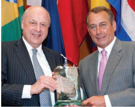
AS/COA Chairman Amb. John NegroponTE awards Speaker of the U.S. House of Representatives John Boehner the Council of the Americas Chairman's Award for Leadership in the Americas.