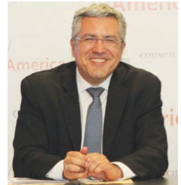
Alexandre Padilha, Minister of Health, Brazil