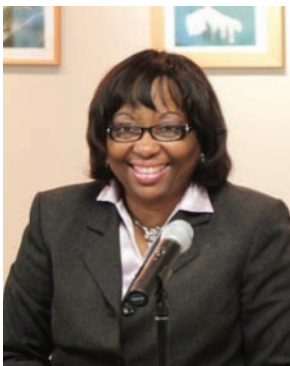
Dr. Carissa Etienne, incoming Director of the Pan American Health Organization