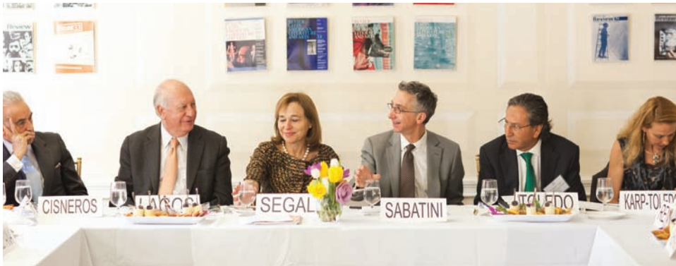
AQ Editorial Board meeting on April 19, 2012

Americas Quarterly is the premier journal dedicated to policy analysis and debate on economics, finance, politics, and social development in the Western Hemisphere. In 2012, AQ focused on China's Global Rise (Winter 2012), Social Inclusion (Spring 2012), Gender Equality (Summer 2012), and Latin America's Real Middle Class (Fall 2012). The Spring 2012 issue unveiled the Social Inclusion Index, a regular analysis that compares social inclusion in 11 countries, and included a special photo and essay series on 24 heroes of social inclusion in which former President Bill Clinton reflects on former Supreme Court Justice Thurgood Marshall. In April, the journal celebrated its five-year anniversary with a discussion and reception with former President of Peru Alejandro Toledo and former President of Chile Ricardo Lagos. AQ also expanded its multimedia presence through a new collaboration with NTN 24 network's Efecto Naim news magazine. In addition, AQ Online ( www.AmericasQuarterly.org ) featured regular web exclusive articles and daily blog posts from around the hemisphere.