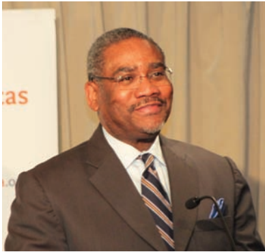
Discussion on U.S.-Brazil Relations & President Rousseff's Visit to Washington. U.S. Congressman Gregory Meeks (D-NY)

In 2012, Washington programs highlighted topics related to foreign policy, health care, energy, and more. On trade policy, we convened a public panel on Western Hemisphere views of the Trans-Pacific Partnership and a discussion of implementation of the U.S.-Colombia free-trade agreement. In the run-up to the Summit of the Americas, we hosted U.S. and Colombian government officials. Council of the Americas also strengthened its position as the preeminent space for engagement with the hemispheric diplomatic community.