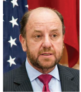
Alfredo Moreno, Minister of Foreign Affairs, Chile