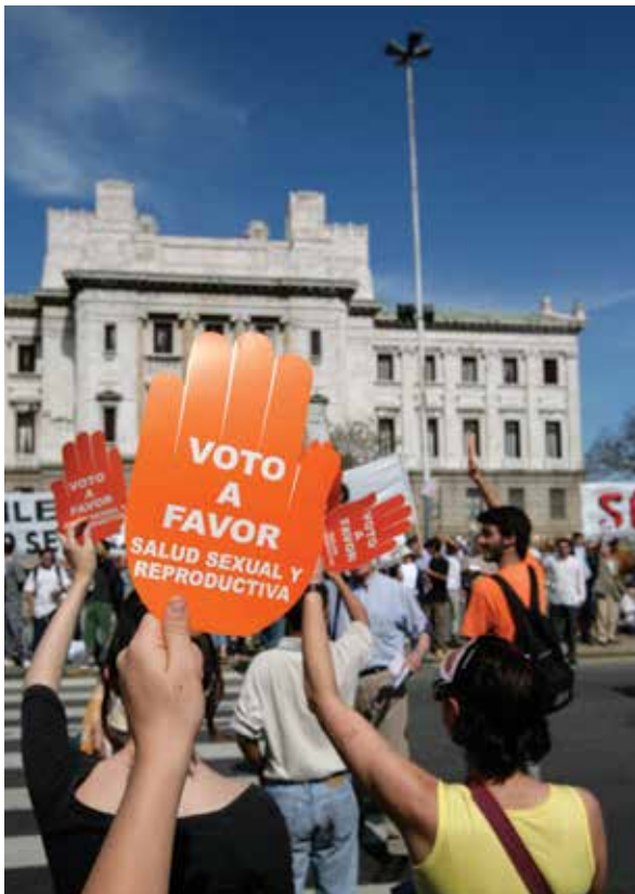
I vote yes: Uruguayans march in favor of legalizing abortion in 2008.

2 Empower women. From health to politics, Uruguay has increasingly supported women's rights. It is the only country in our Index that allows for full reproductive rights for women, after decriminalizing abortion in 2012. While many countries in the region boast high numbers of women in political power and quota laws to support women in legislative positions, such as Argentina, Chile and Nicaragua, this does not directly translate to increased protection for reproductive rights. However, the tide could slowly be turning, as evidenced by Chile, where President Michelle Bachelet has followed through on a campaign promise to introduce legislation that ends the country's ban on abortion. And while abortion is illegal in many countries across the region, it doesn't mean that women are not getting them—a topic brought to the forefront as the Zika epidemic surged across Latin America.