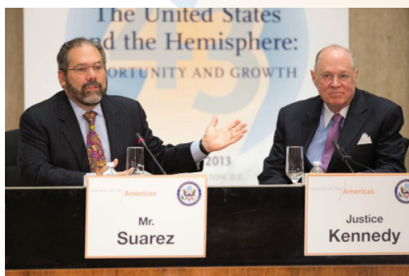
Associate Justice Kennedy interviewed by Ray Suarez of the PBS NewsHour