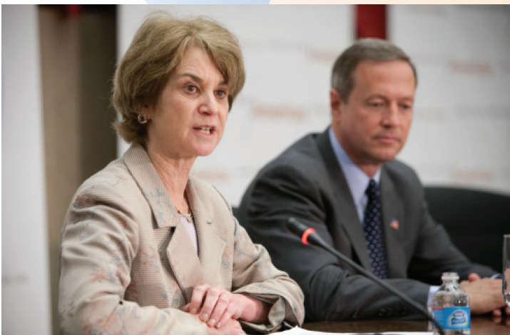
Governor O'Malley interviewed by Kathleen Kennedy Townsend

On immigration reform, O'Malley explained his view that policy changes will bring economic benefits to the United States. “I believe that immigration and the arrival of new Americans is an energy that recharges our creative battery as a people,” he said. “We believe that policies of inclusion... help build innovation and the creative class.”