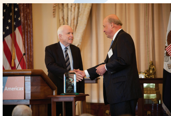
Senator McCain receives the Chairman's Award for Leadership in the Americas from Council of the Americas Chairman John Negroponte