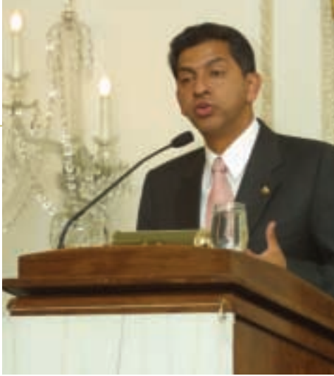
H.E. Lucio Gutiérrez , President of Ecuador , at a private meeting with Council members in New York. February 13, 2003.