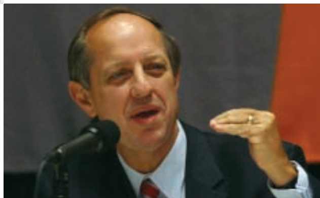
Hon. Lino Gutiérrez , U.S. Ambassador to Argentina , at the Council's office in Washington, D.C., discussed Argentina's foreign policy with Council of the Americas members, particularly in light of the country's debt negotiations with the International Monetary Fund and foreign investors. June 18, 2003.