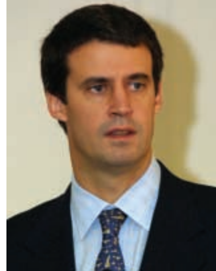
Left: The Most Honorable P.J. Patterson , Prime Minister of Jamaica , taking part in the "Tinker Visitor Series," addressed Council members and guests outlining the political and economic agendas of his administration. October 3, 2003.