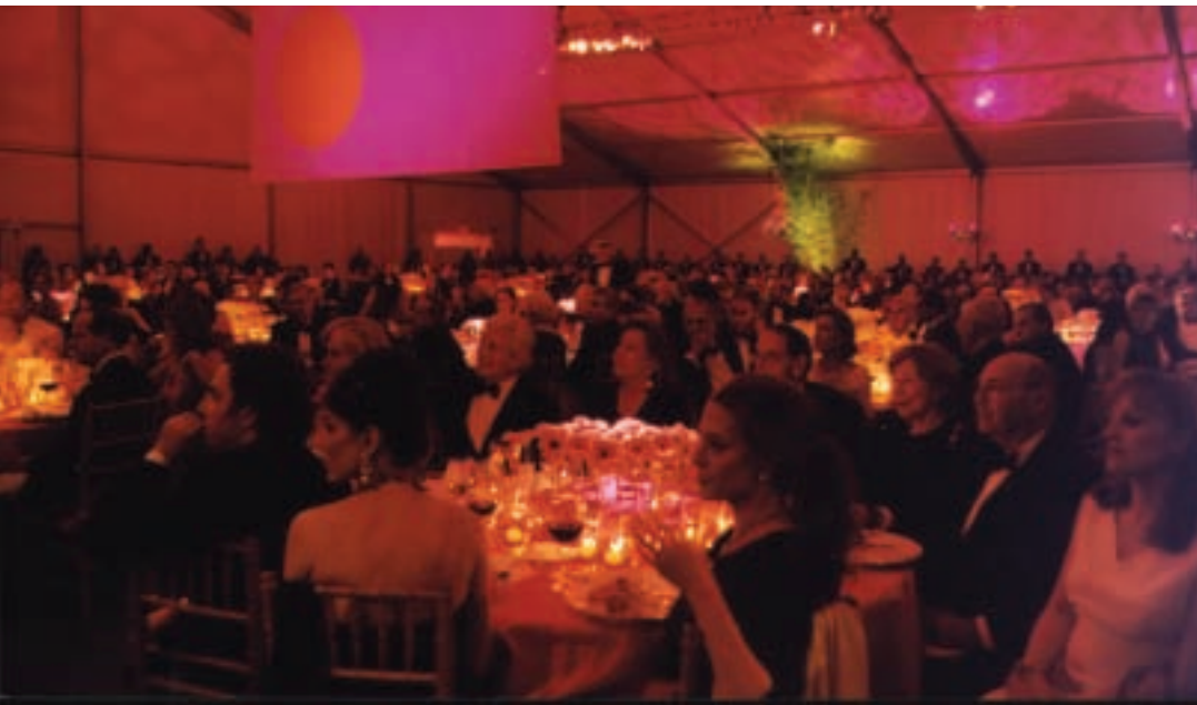
More than 600 guests attended the 2003 Spring Party benefit gala, held in a tent set up at Lincoln Center.