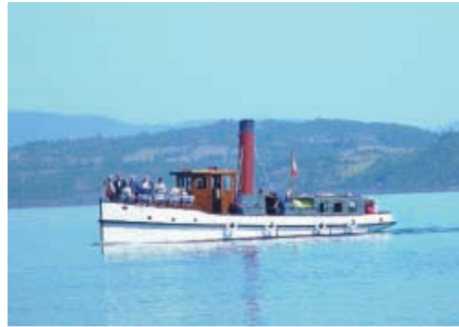
Above: Chairman's Council members enjoy an offsite moment at the Lake Region in the south of Chile.