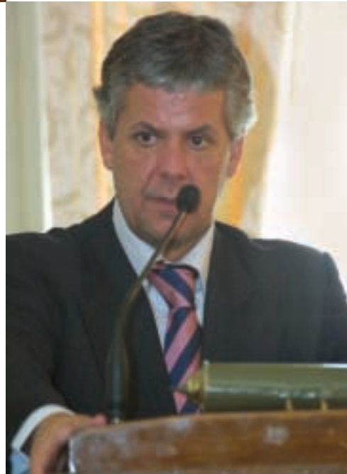
H.E. Nicolás Eyzaguirre , Minister of Finance, Chile , conferred on the country’s positive prospects for growth in 2003, the state of foreign direct investment flows, its readiness to respond to external shocks, and the country’s increasing role in the global economy. April 14, 2003.

H.E. Francisco Gil Díaz , Secretary of Finance and Public Credit, Mexico , addressing Council members and guests. September 25, 2003.