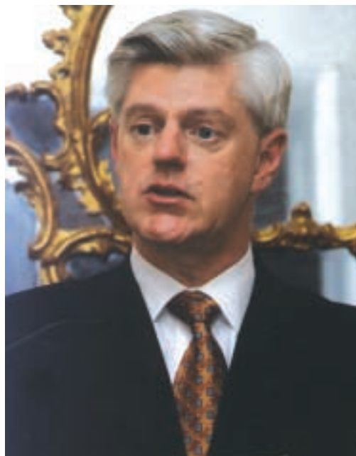
“Progress and Partnership in Uncertain Times.” Hon. John Manley , Deputy Prime Minister and Finance Minister of Canada , at a private event for Council members in New York. He discussed Canada's economic outlook and the changes that the neighboring country has undergone since the fiscal crisis of the mid-'90s. November 24, 2003.