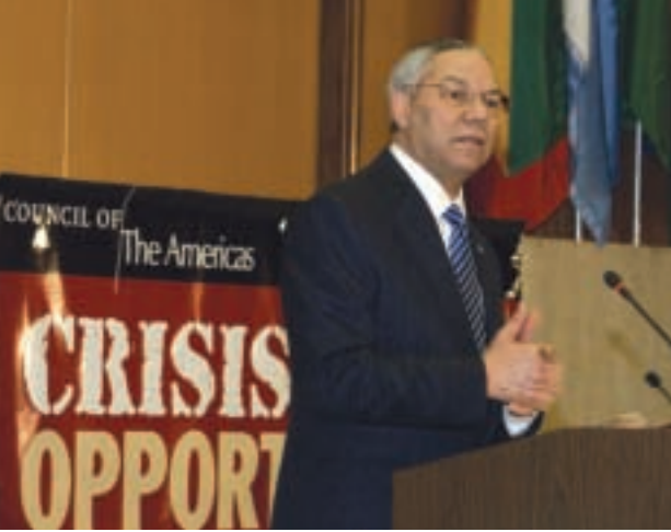
Left: Hon. Colin L. Powell , U.S. Secretary of State