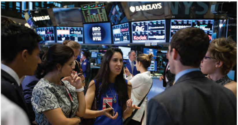
LEFT: INTERIOR VIEW OF 680 PARK AVENUE; ABOVE: NYSE OPENING BELL & TOUR FOR YPA MEMBERS, JULY 29, 2015.

Young Professionals of the Americas (YPA) is an international network that provides a platform for young professionals in their 20s and 30s to connect around the latest trends in the Americas through its New York City and Miami chapters. Members come from various nationalities and represent a diverse spectrum of professional sectors, including venture capital and finance, fashion, government, design, consulting, law, and the arts. Membership offers exclusive access to our networking and social events, such as private art fair tours, concerts, and intimate talks with industry leaders around professional development.