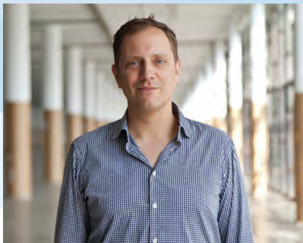
JOCHEN VOLZ.