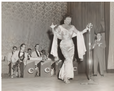
PUERTO RICAN SINGER RUTH FERNANDEZ AT THE CABORROJEÑO SOCIAL CLUB, OCTOBER 17, 1956.