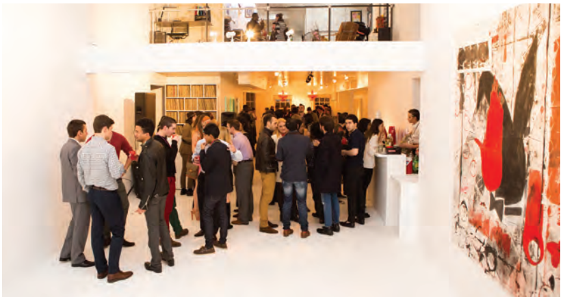
LEFT: EXTERIOR VIEW OF 680 PARK AVENUE; ABOVE: YPA "UNA NOCHE EN EL ESTUDIO" PARTY AT SOHO ARTHOUSE, DECEMBER 2015

Young Professionals of the Americas (YPA) is an international network that provides a platform for young professionals in their 20s and 30s to connect around the latest trends in the Americas through its New York City and Miami chapters. Members come from various nationalities and represent a diverse spectrum of professional sectors, including venture capital and finance, fashion, government, design, consulting, law, and the arts. Membership offers exclusive access to our networking and social events, such as private art fair tours, concerts, and intimate talks with industry leaders around professional development.