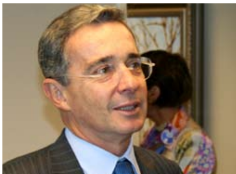
Álvaro Uribe, President of Colombia