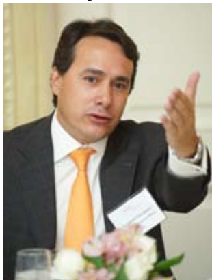
Gerardo Ruiz Mateos, Secretary of Economy, Mexico