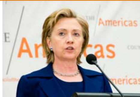
Hillary Clinton, U.S. Secretary of State

Secretary of State Hillary Clinton closed the 39th annual Washington Conference of the Americas, emphasizing the United States' commitment to promoting social equality and engaging other countries in solutions to regional issues. Leading administration officials joined hemispheric leaders to discuss economic integration, social inclusion, security, and the question of Cuba.