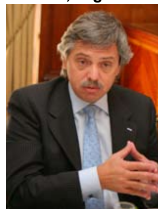
Alberto Fernández, Former Chief of Cabinet, Argentina