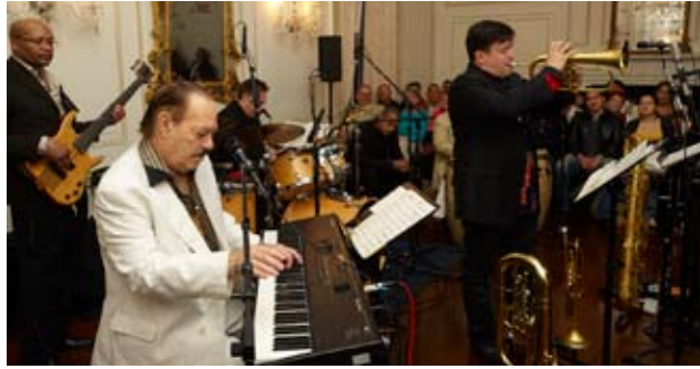
Larry Harlow and the Latin Jazz Encounter