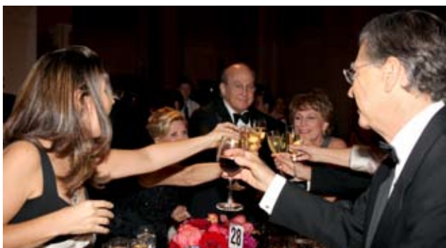
A birthday toast to David Rockefeller