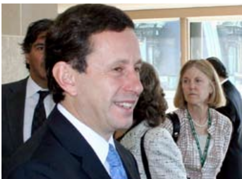
José de Gregorio, President of the Central Bank, Chile