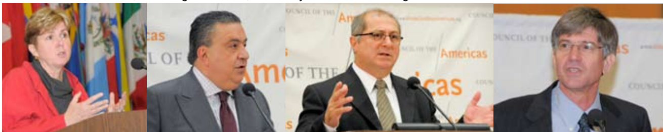
L to R: Jane Holl Lute, U.S. Deputy Secretary of Homeland Security; Fernando Gómez-Mont, Secretary of Government, Mexico; Paulo Bernardo, Minister of Planning, Budget, and Management, Brazil; James Steinberg, U.S. Deputy Secretary of State