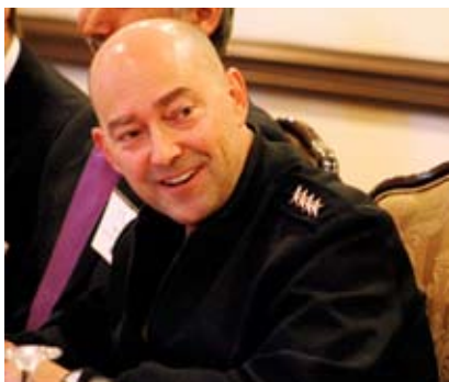
Admiral James Stavridis, Commander, U.S. Southern Command