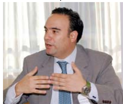
Luis Guillermo Plata, Minister of Trade, Industry and Tourism, Colombia