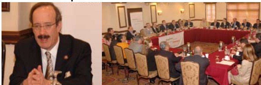
Congressman Eliot L. Engel (D-NY); private meeting