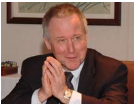
James Lambert, Canadian Ministry of Foreign Affairs