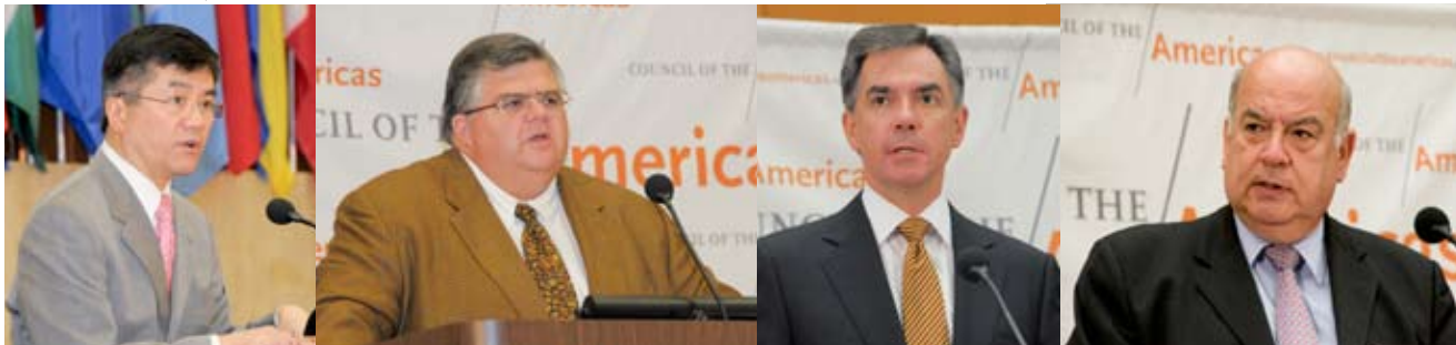
L to R: Gary Locke, U.S. Secretary of Commerce; Agustín Carstens, Secretary of Finance, Mexico; Jim Prentice, Minister of Environment, Canada; José Miguel Insulza, Secretary General of the Organization of American States