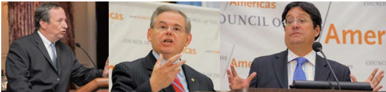
L to R: Lawrence H. Summers, Director of the National Economic Council; Senator Robert Menendez (D-NJ); Francisco Santos Calderón, Vice President of Colombia