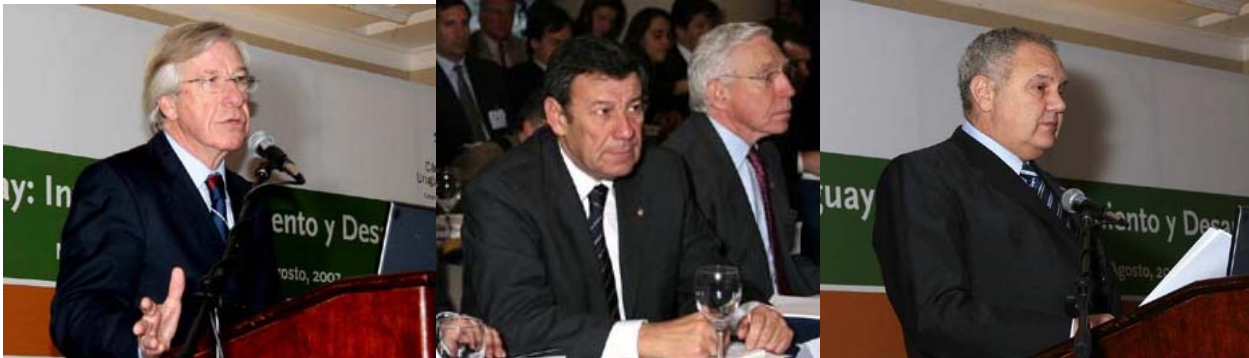
L: Danilo Astori , Minister of Economy and Finance. Center: Rodolfo Nin Novoa , Vice-President. R: Jorge Lepra , Minister of Industry, Energy, and Mines.