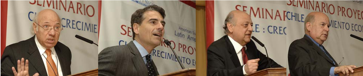
L to R: Vittorio Corbo , President of the Central Bank; Andrés Velasco , Minister of Finance; José Antonio Viera Gallo , Minister Secretary General of the Presidency; José Miguel Insulza , Secretary General of the Organization of American States.