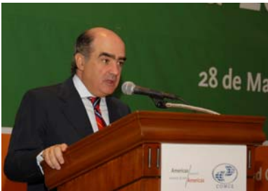
L: Luis Téllez , Secretary of Communication and Transportation.