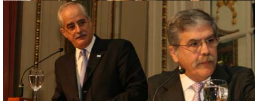
Top L: Alberto Fernández , Chief of Cabinet. Top Center: Martín Redrado , President of the Central Bank. Bottom L: Jorge Taiana , Minister of Foreign Relations, International Trade, and Worship. Bottom Center: Julio de Vido , Minister of Federal Planning, Public Investment, and Services. R: Cristina Fernández de Kirchner , then-Senator and presidential candidate.