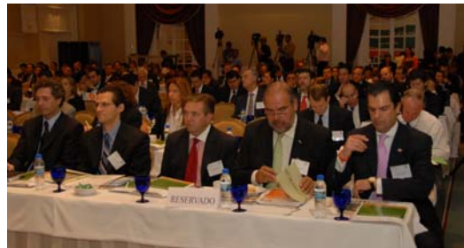
R: Audience members.